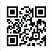
Banners & Billboards