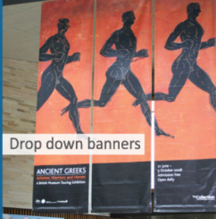
Drop down banners

HIGH SPEED, HIGH QUALITY & MAX PRODUCTIVITY; BEST VALUE FOR MONEY